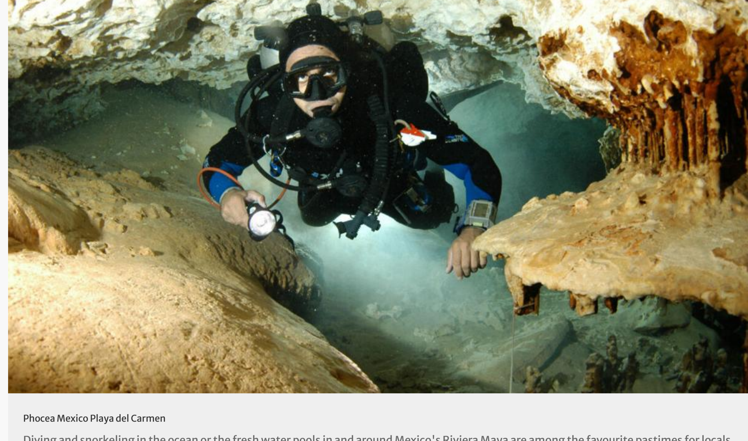
Phocaea Mexico Playa del Carmen Diving and snorkeling in the ocean or the fresh water pools in and around Mexico's Riviera Maya are among the favourite pastimes for locals and visitors. There are many dive shops and places to rent snorkel gear, from Cancun in the north to Tulum in the south.